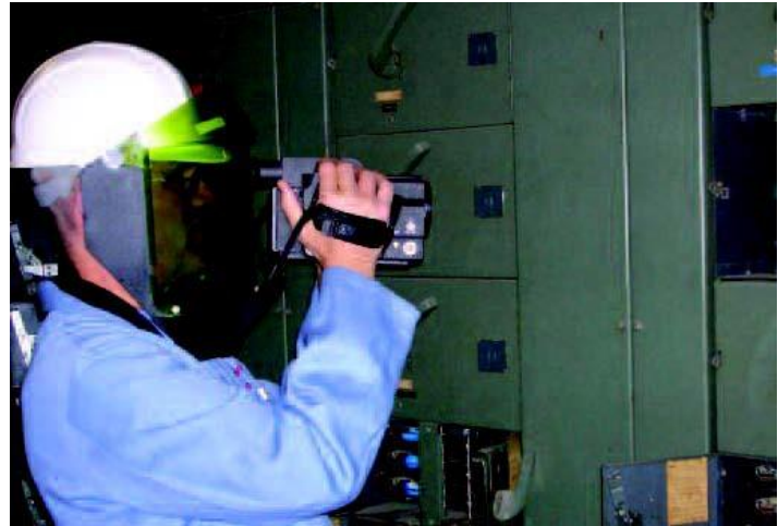
Infrared thermographers look for hot spots that could indicate loose connections and other electrical problems.